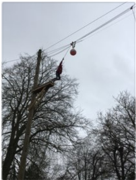
An example of high challenge on the High Ropes course at Braeside!