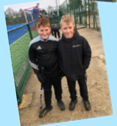
A FEW MEMBERS OF OUR YEAR SIX HOCKEY TEAM