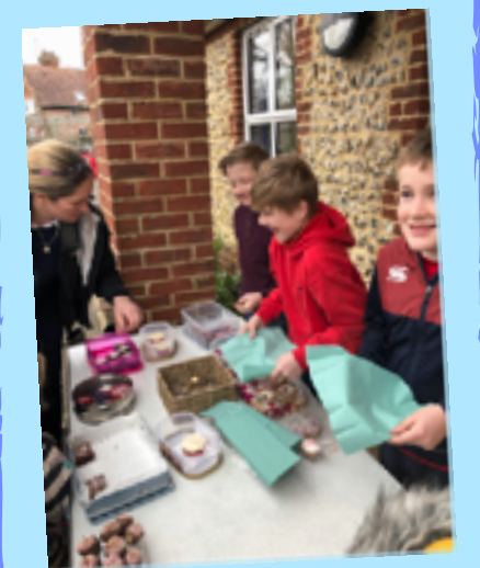
AND RAISING MONEY FOR THE AIR AMBULANCE LED BY CRAVEN HOUSE