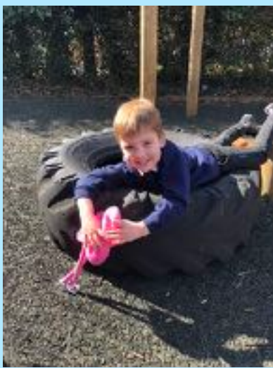
FLAMINGO CLASS EVEN HAVE A LOVELY MASCOT KINDLY MADE BY A MEMBER OF OUR VILLAGE!