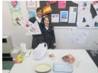
The stall that looked at animal organs was a great hit!

Partnership we continue to participate in various events. This term some Year 6 pupils have benefited from gifted and talented writing and Maths sessions. This is a great link for us as a school to have access to. Future events will be including our school councils working together.