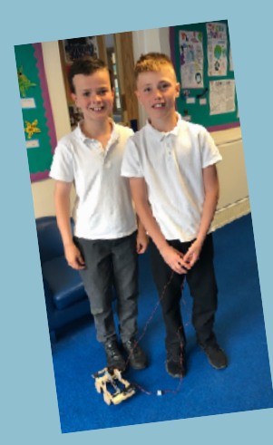
OUR WHOLE SCHOOL DT PROJECT OF UNDERWATER VEHICLES HAS BEEN A HUGE SUCCESS!