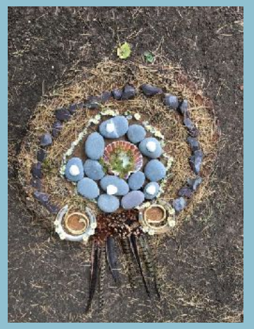
OUTDOOR ART INSPIRED BY ANDY GOLDSWORTHY