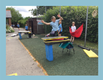
PLAYPOD AT PLAYTIMES CONTINUES TO BE A FANTASTIC ACTIVITY FOR ALL CHILDREN