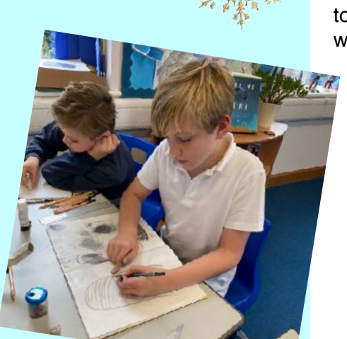
BUSY AT WORK SKETCHING IN PREPARATION FOR ART WORK

During the festive day, we were excited to find that footprints and a sack of presents for each class had been left at each classroom door. Thank you Father Christmas for this special delivery!