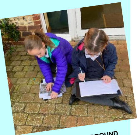
USING A COMPASS AROUND OUR SCHOOL GROUNDS AS PART OF GEOGRAPHY

We cannot thank our FOBS committee enough. Throughout the