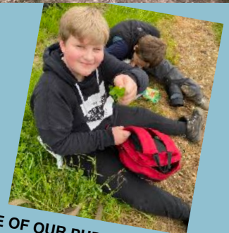
SOME OF OUR PUPILS HAD A REALLY LUCKY DAY DURING THE SPONSORED WALK!