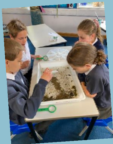
COUNTING SPECIES FROM THE RIVER KENNET