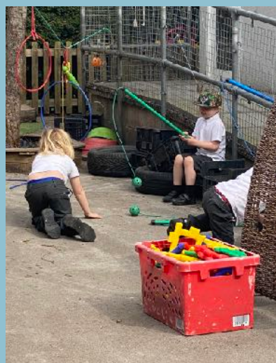
FISHING GAMES IN ROBINS! OUR YOUNGEST CHILDREN HAVE BEEN ENJOYING USING THE OUTSIDE AREA FOR LOTS OF CREATIVE GAMES.