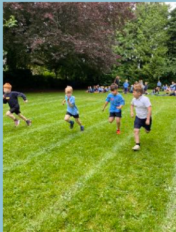
RUNNING INTO SPORTS DAY