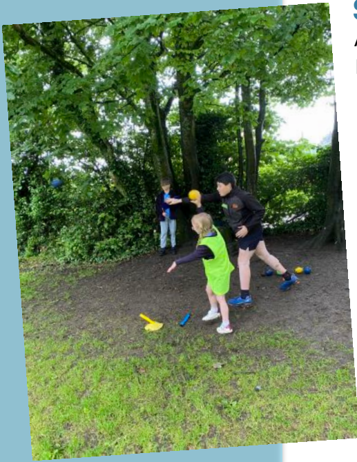
KEY STAGE 1 ATHLETICS IN THE MORNING WAS A SUCCESS!