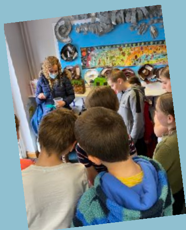
LOTS OF QUAIL QUESTIONS!