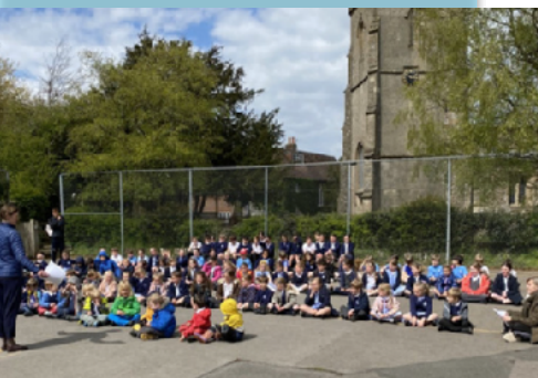
THE FIRST OUTDOOR WORSHIP