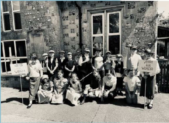
A PHOTO FROM TODAY OR THE 1800'S?