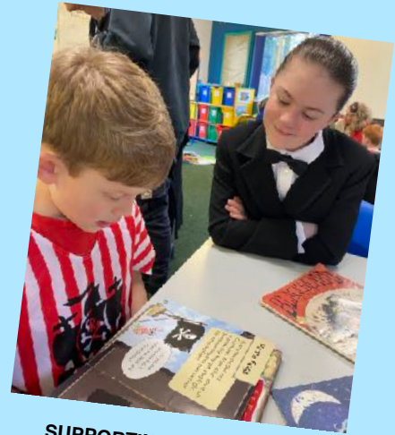
SUPPORTING EACH OTHER IN READING THROUGHOUT THE SCHOOL WAS A FABULOUS ADDITION TO WORLD BOOK DAY.