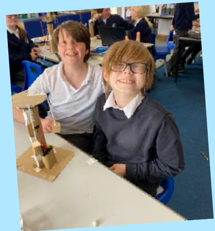
COMPUTING IN HAWKS THIS TERM.