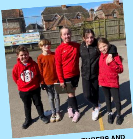
YEAR 6 CRAVEN MEMBERS AND HELPERS FOR THE SPORTS ACTIVITIES.