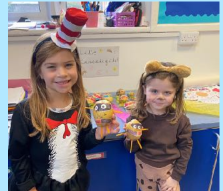
ROBINS PUPILS EXPLORED THE BOOK SUPERTATO AS PART OF WORLD BOOK DAY.

You might remember that in the previous newsletter we featured a subject focus on Design and Technology. This term Key Stage 2 not only completed work on mechanisms (pop up books), but also food technology. Working on a Mediterranean theme all Key Stage Two classes created and designed ambitious three course meals together, exploring food type, seasonality and finally evaluating through tasting sessions.