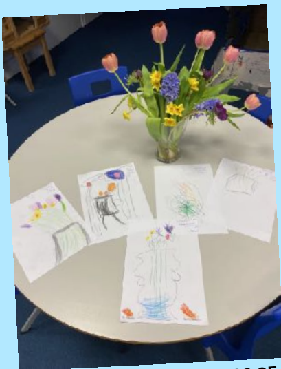
OBSERVATIONAL DRAWINGS OF SPRING FLOWERS IN ROBINS CLASS.