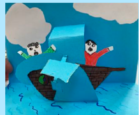
DT WORK ON MECHANISMS FINAL PRODUCTS RETOLD SHAKESPEARE'S 'TWELFTH NIGHT'.