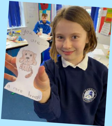
SOMETIMES LEARNING HAPPENS OUTSIDE OF LESSONS. AFTER A WORSHIP ON KINDNESS TOWARDS OUR FRIENDS SKYLARKS CREATED LITTLE NOTES FOR EACH OTHER!