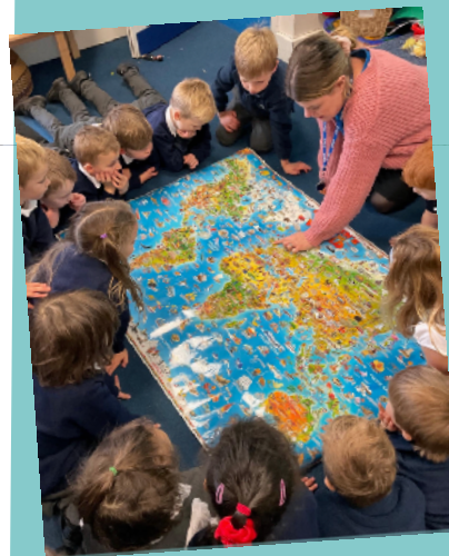
WHOLE CLASS GEOGRAPHY LEARNING IN ROBINS!