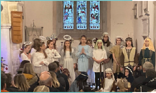
HAWKS SECTION OF THE PERFORMANCE