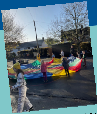
ROBINS ENJOYED THE YEAR 6 LED OUTDOOR CHILDREN IN NEED ACTIVITIES!