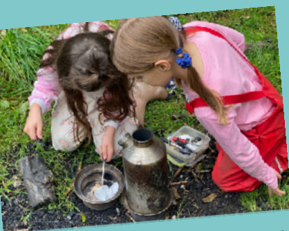
FOREST SCHOOL INVESTIGATIONS IN THE AUTUMN