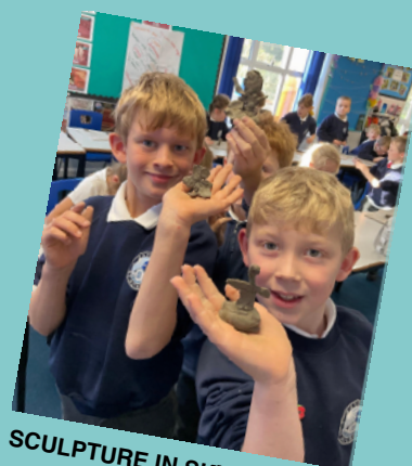
SCULPTURE IN SKYLARKS