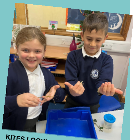
KITES LOOKING AFTER THEIR PET STICK INSECTS - DID YOU KNOW WE HAVE STICK INSECTS AS CLASS PETS IN GOLDFINCHES, SKYLARKS, KITES AND HAWKS?