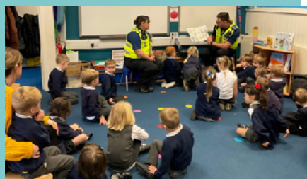
ROBINS LOVED THE STORY THEY HEARD FROM WILTSHIRE POLICE